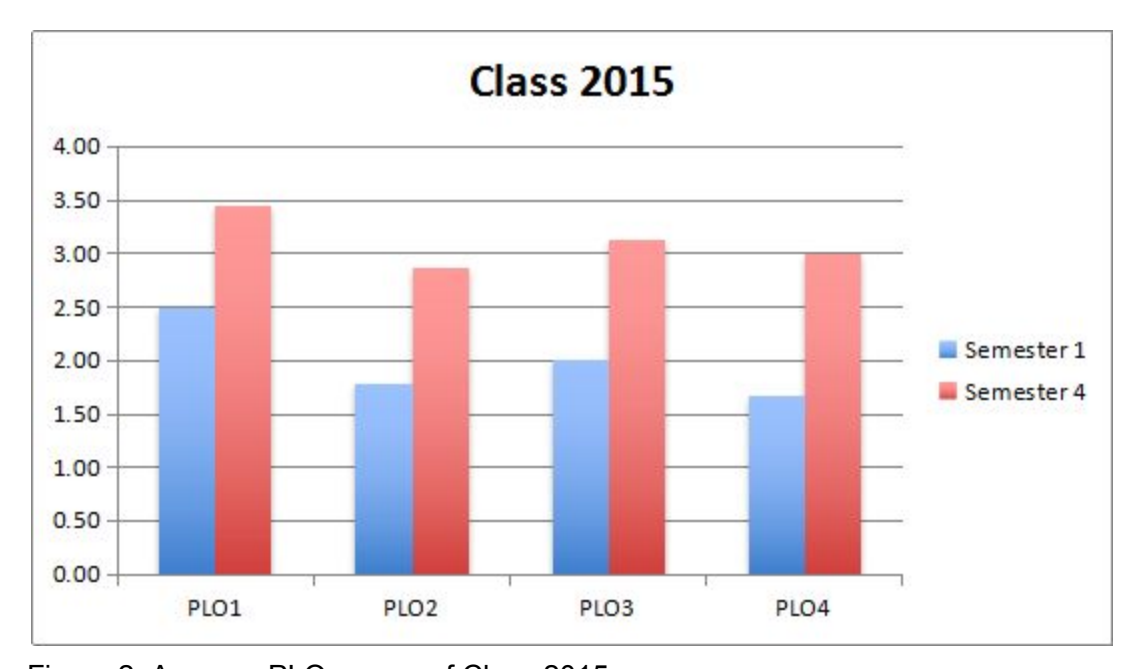
Figure 2. Average PLO scores of Class 2015